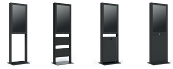
STANDARD BROCHURE STAND WASTE BIN STORAGE

Select optional extras for your Casing. Brochure stand, waste bin or storage.av